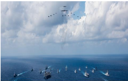
US-Japan joint military rescue exercise 2019 Keen Sword